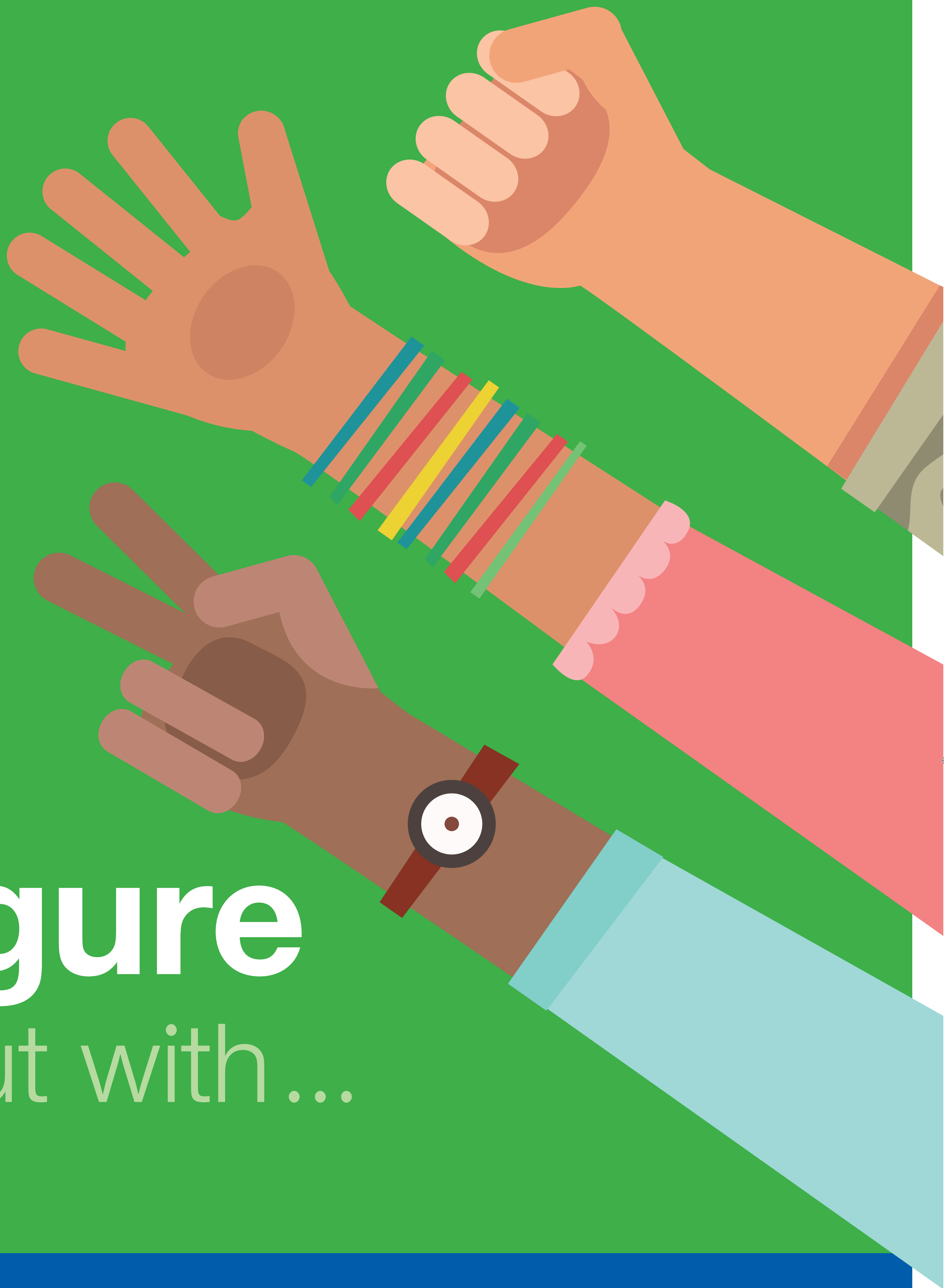
Figure it out with...